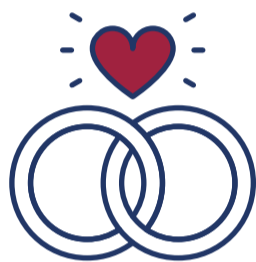
MARRIAGE AND CIVIL PARTNERSHIP

It's against the law to discriminate against someone based on protected characteristics.