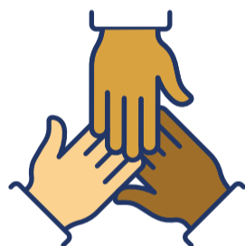
RACE AND ETHNICITY