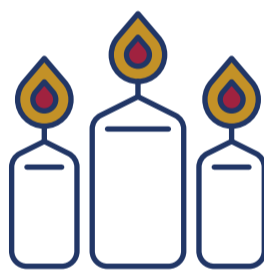
RELIGION OR BELIEF