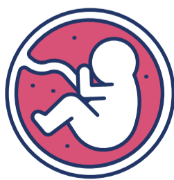
PREGNANCY AND MATERNITY

We live our values of Resilience, Endeavour, Inspiration, Collaboration and Compassion every day, standing up for what's right and speaking out when we see something wrong.